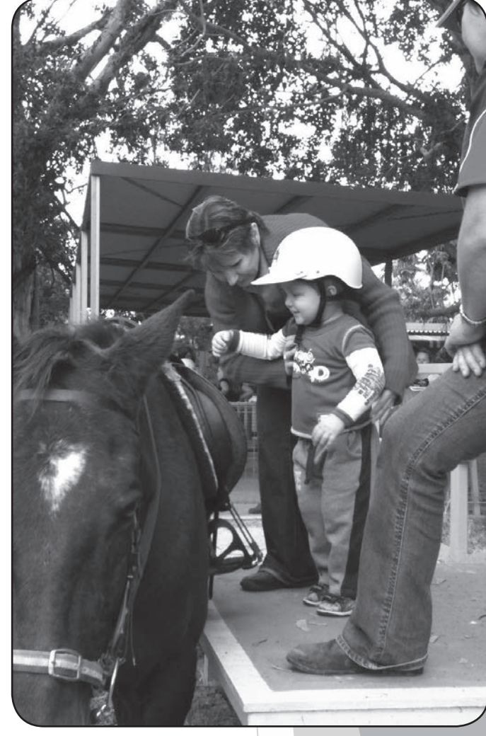
Participants in the Mackay Riding for Disabled training course

The workshop has enabled Mackay Riding for Disabled to increase the number of lessons it provides to the disabled community in the region and access extra hands-on training every month which will allow them to open the riding lessons up to more disabled members as other training coaches pass their accreditation more rapidly.