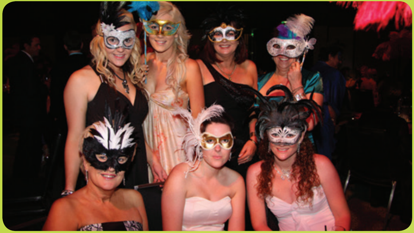
Members of Mackay's real estate industry enjoyed the 2010 Reality Fundraiser while raising much needed funds for The Mackay Foundation