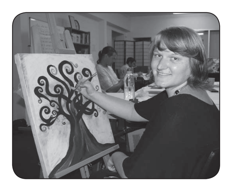
Participant of Arts in Mind Project

"It's terrific! It's a good outlet to get your mind working"