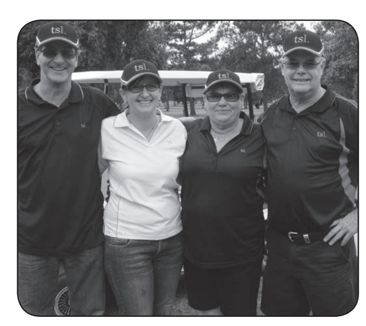
Team Supply Logistics (TSL) enjoying the MAIN Golf Day

Mackay Area Industry Network (MAIN), Bank of Queensland Mackay and Thiess each held golf days during the year, entertaining clients, suppliers, and business associates while raising funds for The Foundation. Much thanks goes to these businesses for their support.